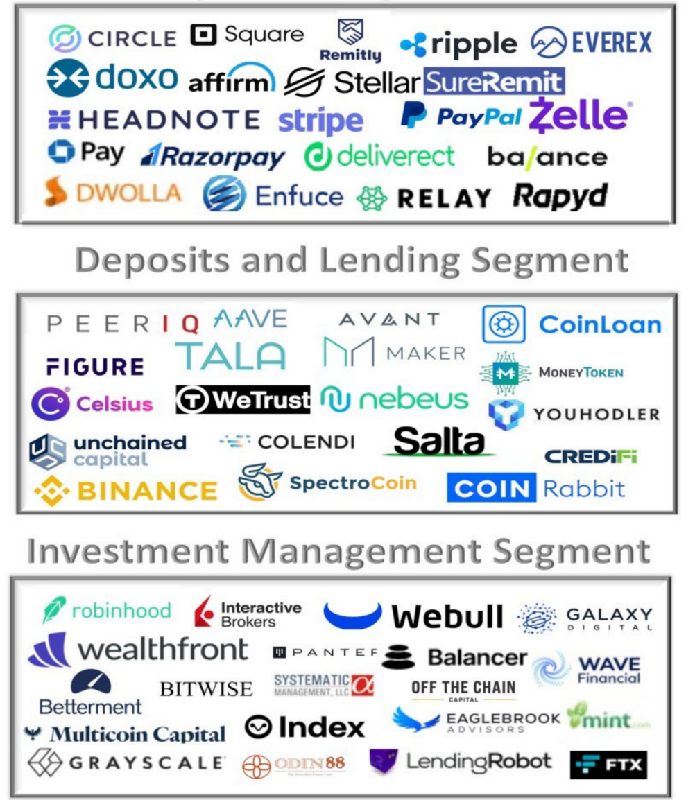
Figure 2. FinTech companies and segments.

For blockchain-based FinTech, it is crucial to understand what exact services a company is attempting to provide in order to understand the core components of these services. By understanding these components, one can formulate a plan to understand the requirements for the technology within this space.