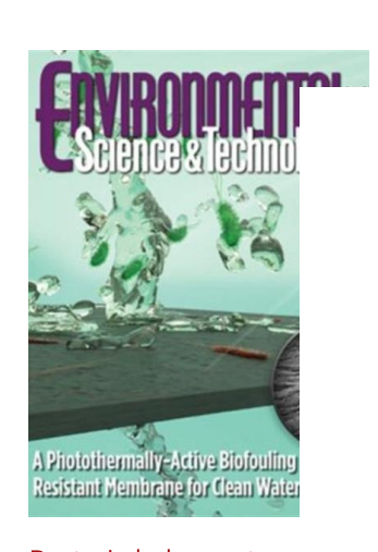
Bacteria help create w filter that kills other bacteria