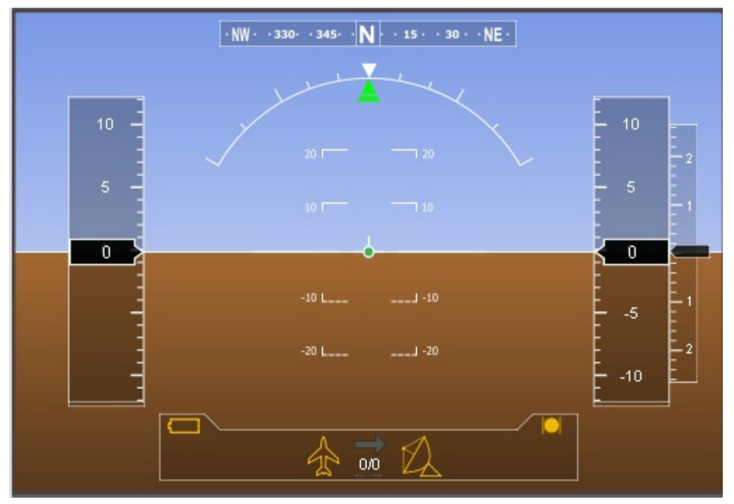
Figure 2: OpenPilot software, courtesy OpenPilot.